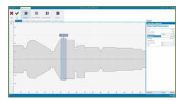
Setting of test characteristics