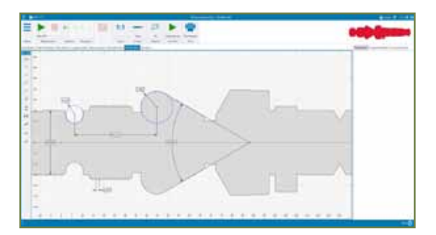
Optimized analysis function