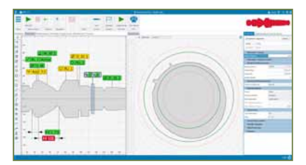
Tear off and free positioning of windows